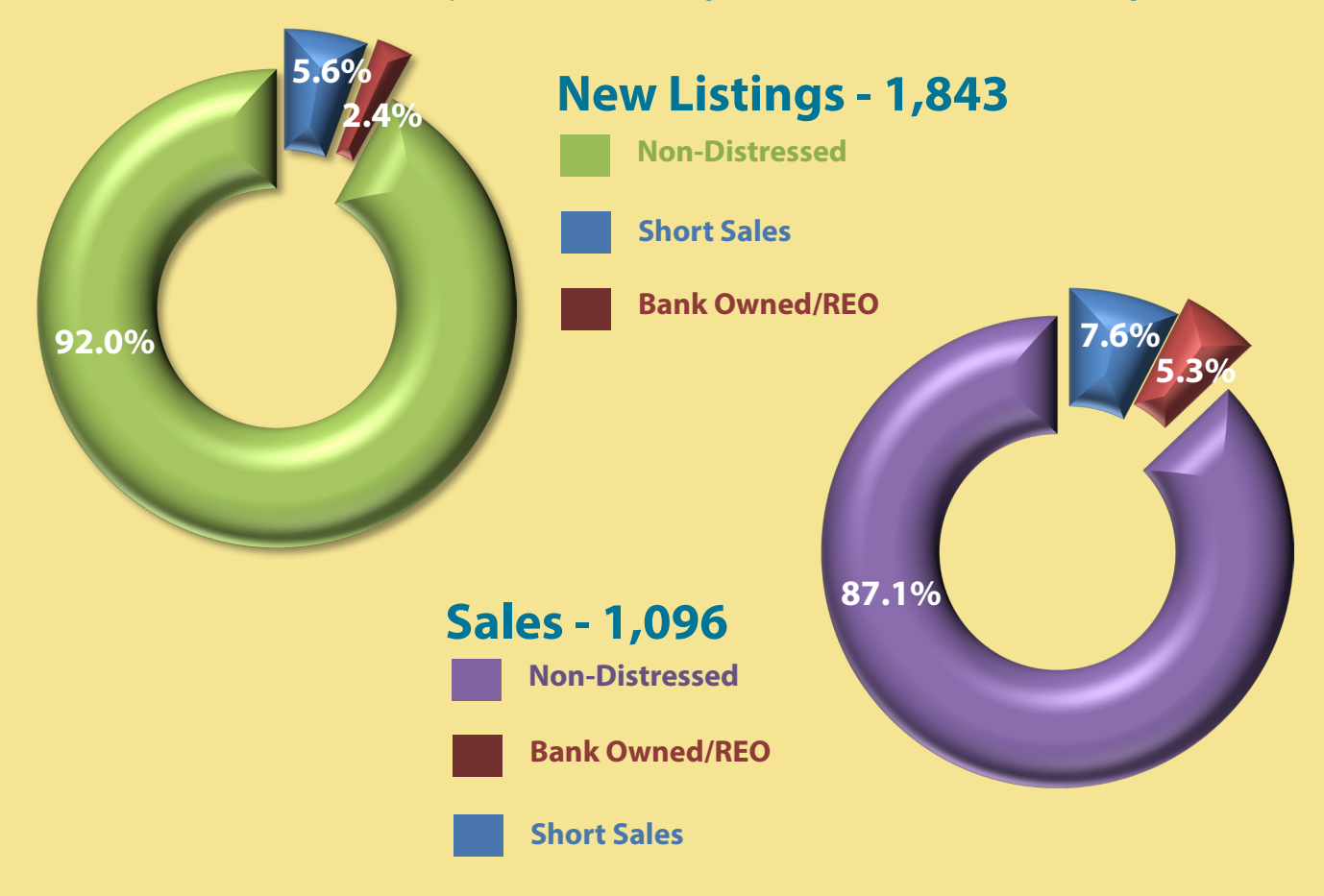
1st Quarter Stats (1/1/2013 - 3/31/2013)

RMLS™ 2nd Quarter Stats (4/1/2013 - 6/30/2013)